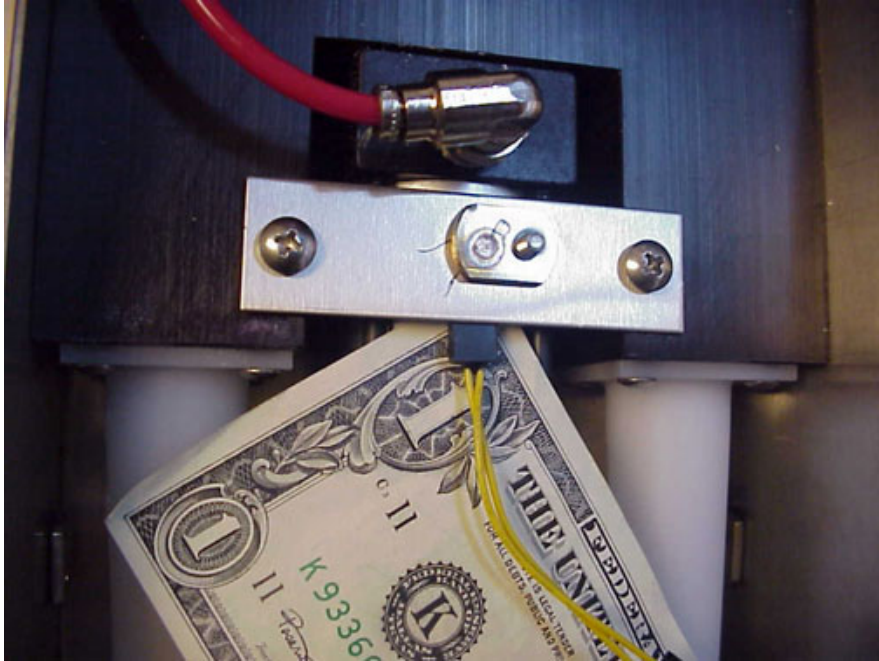
Figure 4: checking for space between the switch and the cylinder