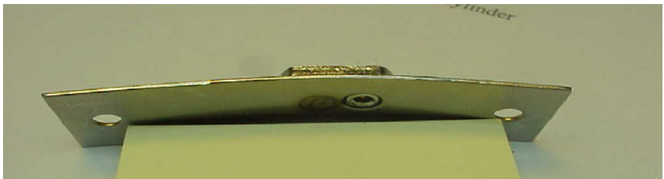
Figure 3: warped switch bracket